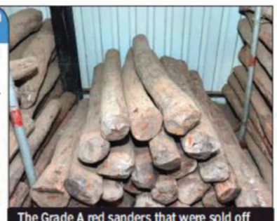
The Grade A red sanders that were sold off

MAJOR MARKETS China, Japan, the Middle East, Sri Lanka, Bhutan and Nepal